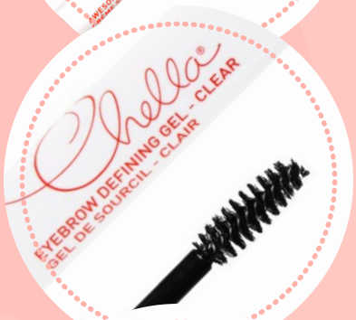
Eyebrow Defining Gel

Goes on like a cream yet looks like a powder Covers hair like a gel yet fills like a powder Purse-friendly all-in-one design (angled brush + cream pot) 6 creamy, dreamy colours